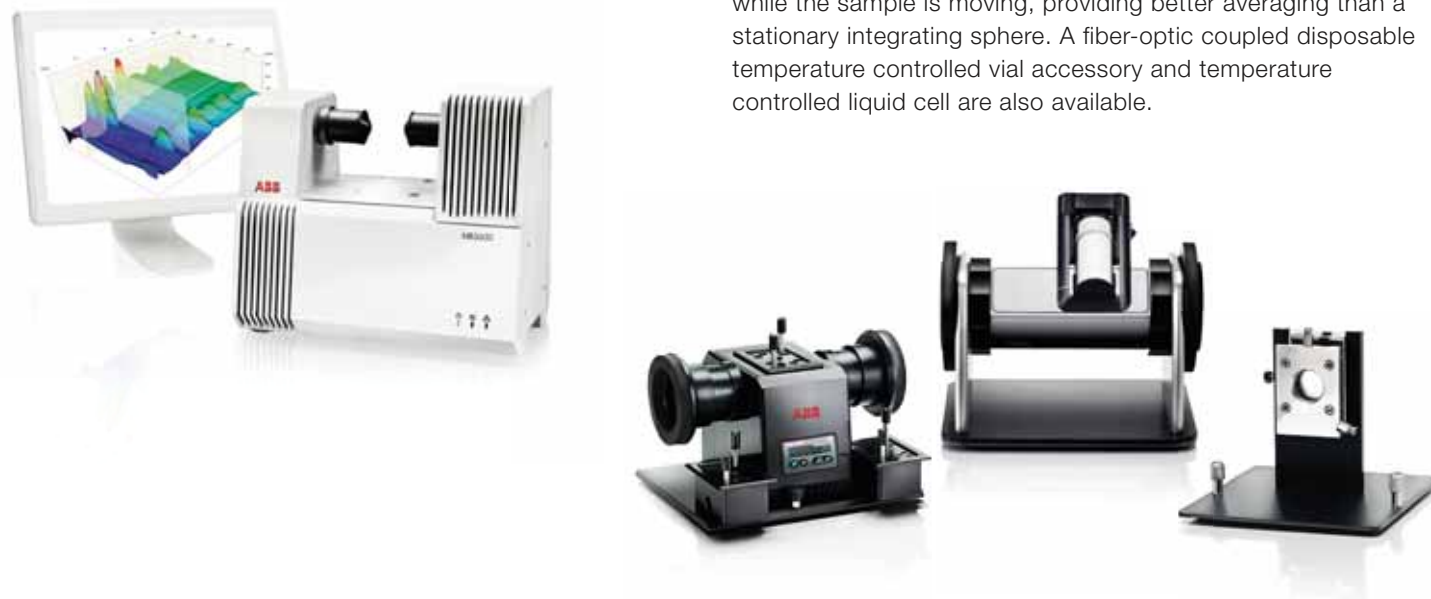
ABB offers a number of well thought-out accessories that are easily swappable. They do not require alignment. The temperature-controlled vial holder is a universal vial sampling accessory for the analysis of liquids in disposable glass vials with diameters of 5 mm, 8 mm and 12 mm OD. The rotating diffuse reflectance accessory measures a large sample area while the sample is moving, providing better averaging than a stationary integrating sphere. A fiber-optic coupled disposable temperature controlled vial accessory and temperature controlled liquid cell are also available.